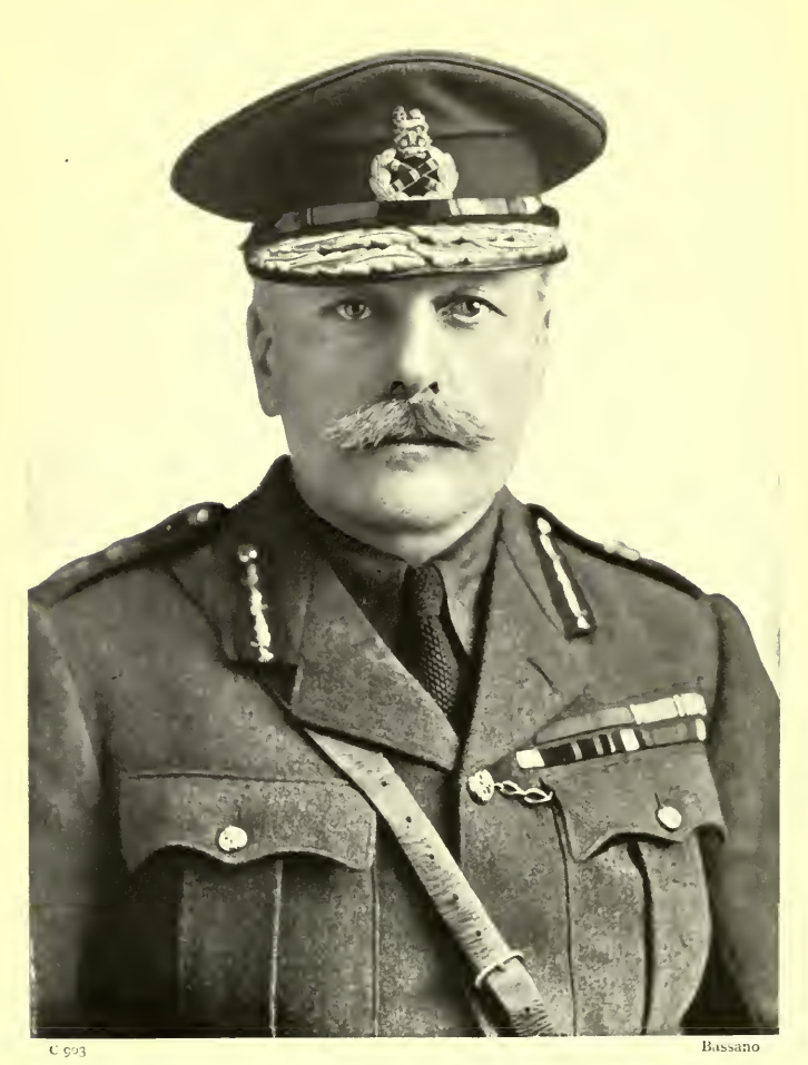
FIELD-MARSHAL SIR DOUGLAS HAIG Commander-in-Chief of the British Army in France and Flanders.